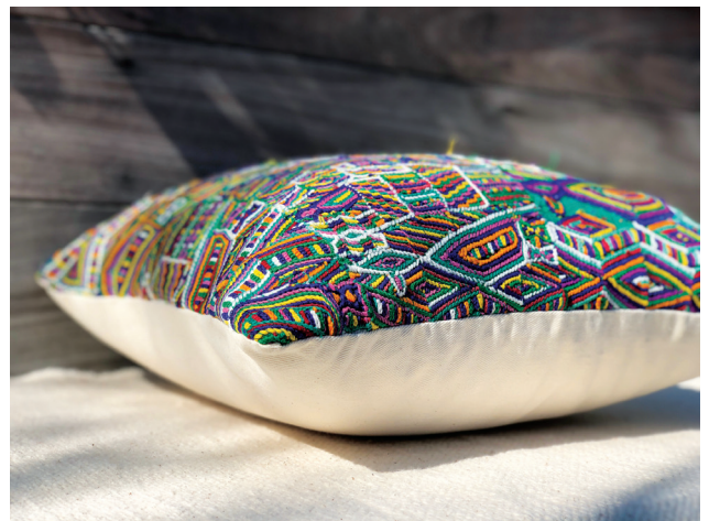
The Nebaj Pillow is handmade within a two-week period with decorative elements that represent the cultural identity of the weaver who made it. Behind the Hill. behindthehill.com CIRCLE #621