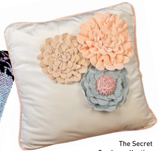
The Secret Garden collection features pillows with their own blooms right on the front. Bethany Lowe Designs. bethanylowe.com CIRCLE #619