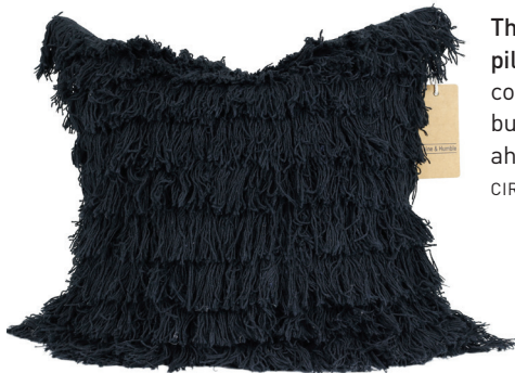
The Black Swan Fringe pillow doesn't sacrifice comfort but keeps hands busy. A Homestead Shoppe. ahomesteadshoppe.com CIRCLE #620