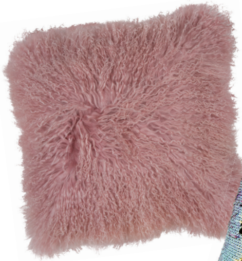
A vintage rose fluffy pillow makes a fuzzy nap all the more restful. Eightmood. eightmood.com CIRCLE #617